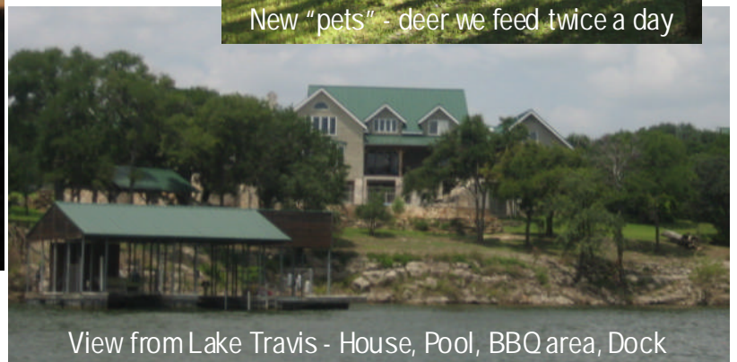
View from Lake Travis - House, Pool, BBQ area, Dock