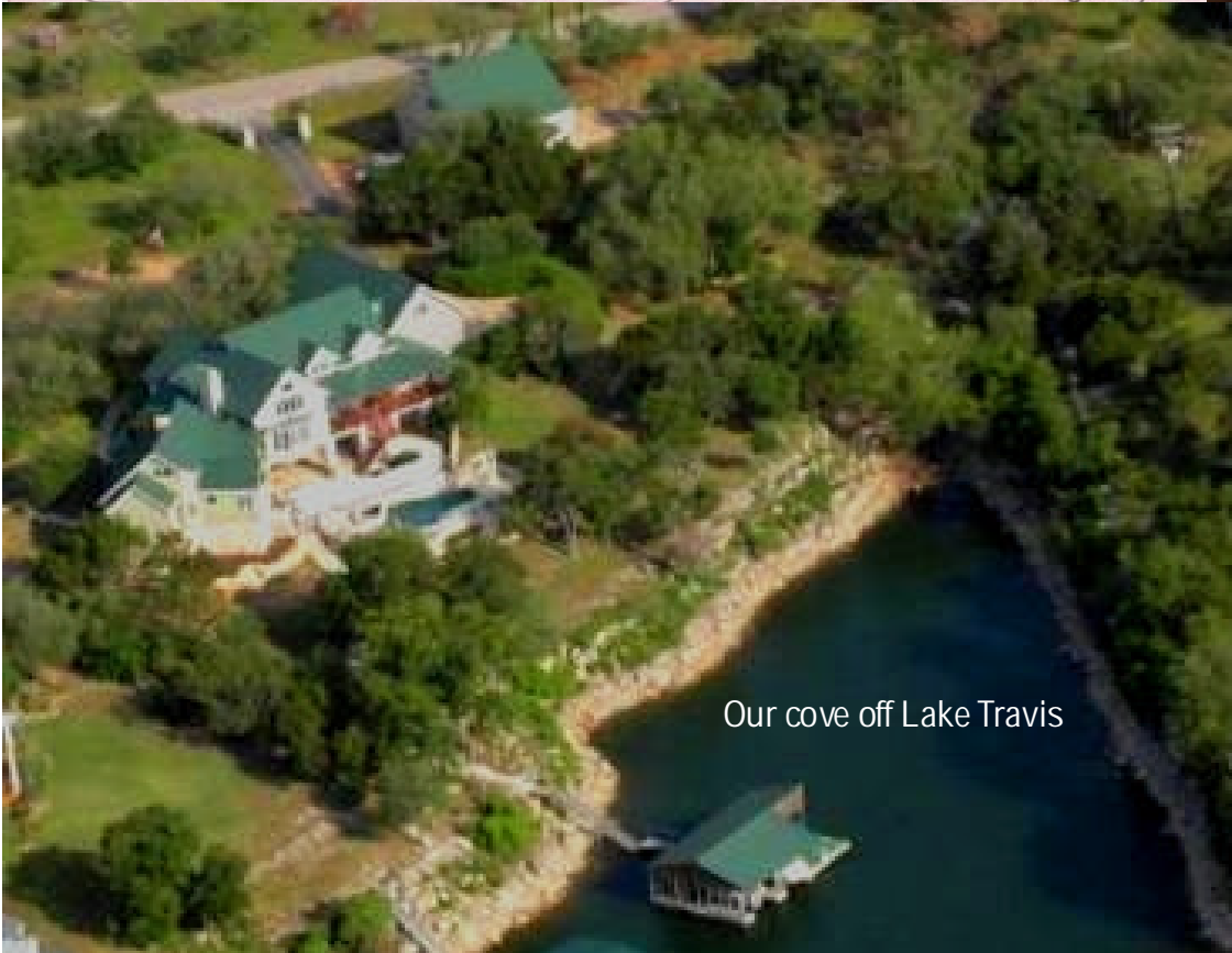
Our cove off Lake Travis