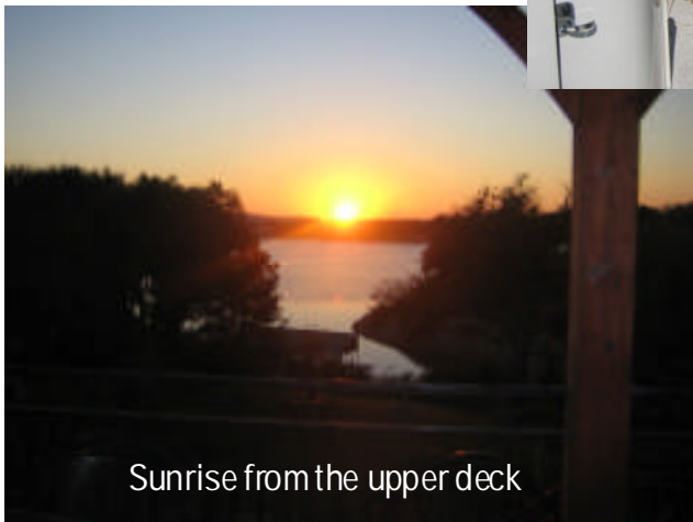
Sunrise from the upper deck