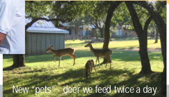
New "pets" - deer we feed twice a day