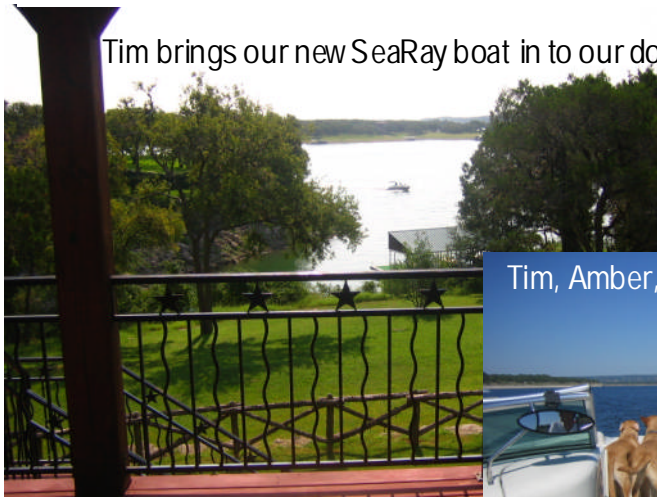
Tim brings our new SeaRay boat in to our dock